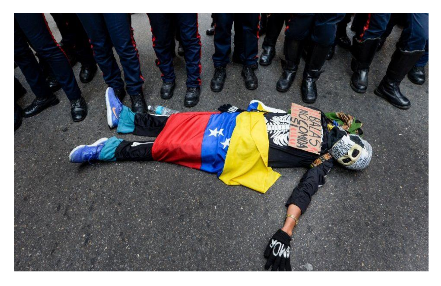
Vast oil reserves have not stopped riots and food shortages in Venezuela